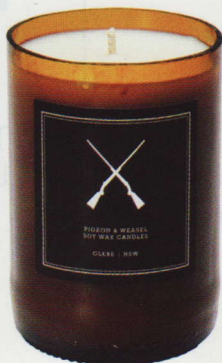
Candle in Red Frogs, from $24.95, Pigeon & Weasel, pigeonandweasel.com.

The spicy licorice fragrance is only trumped by the luxe ceramic jar.