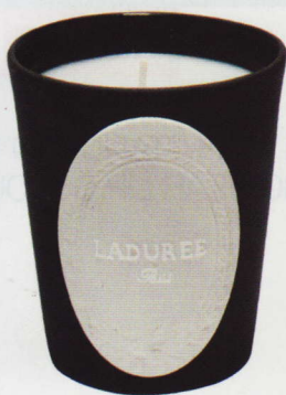
Candle in Reglisse, $59.95, Ladurée from lesupershop.com.

Vanilla schmanilla. Light your fire with something a little more spesh.