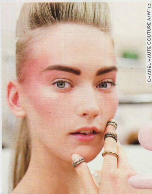
CHANEL HAUTE COUTURE A/W '13